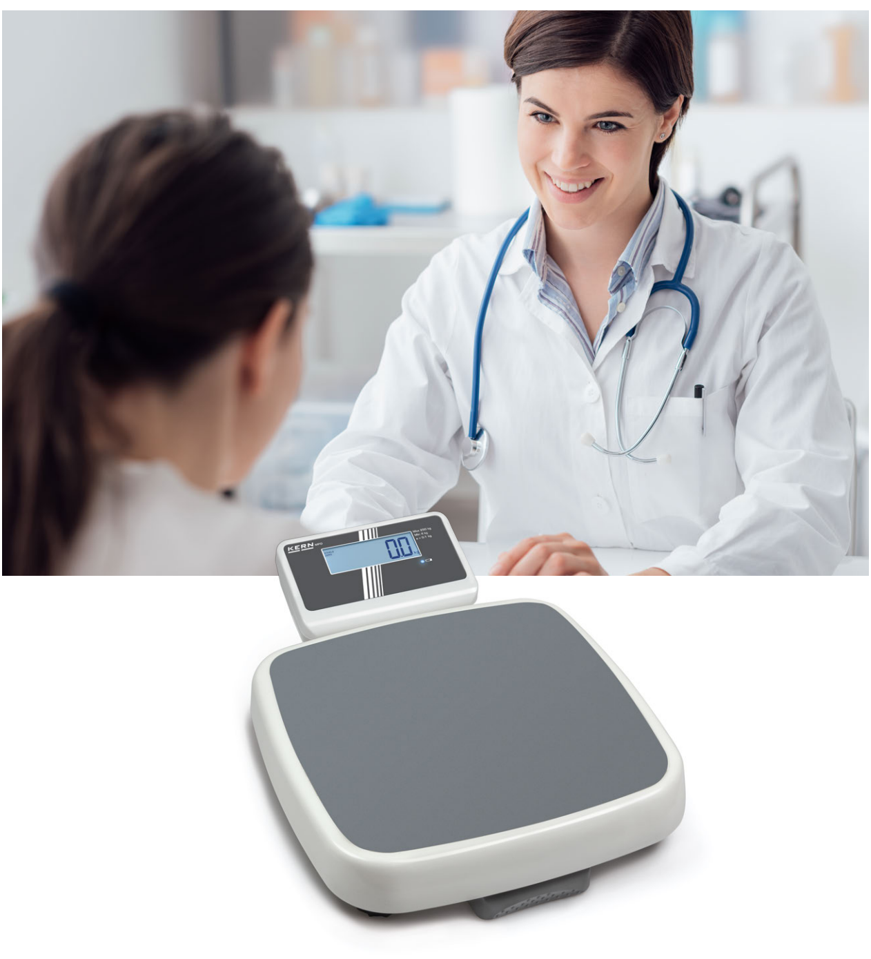
KERN MPD 250K100M

Professional step-on personal floor scales approved as a medical device and with EC type approval class III