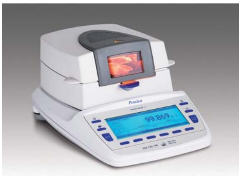
Compactly styled design