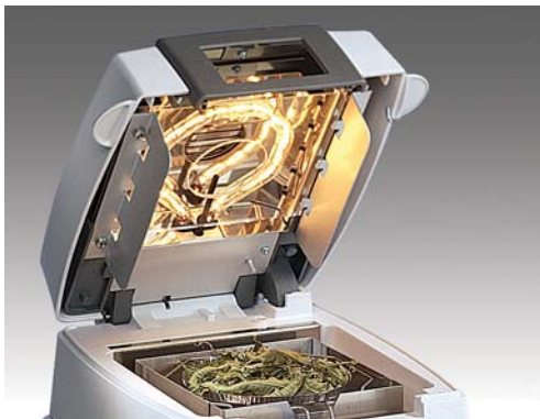
3 different heat sources are optional