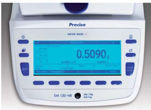
Outstanding graphic Display