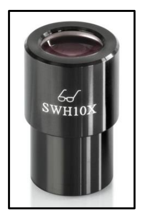
High Eye Point eyepiece (identified by the glasses symbol)