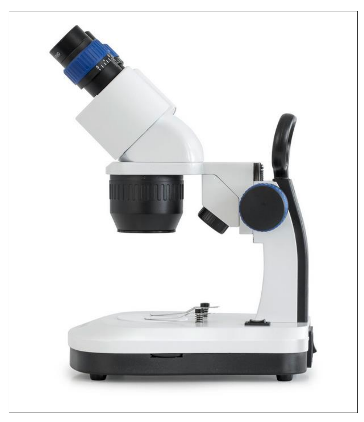
Assembled stereo microscope